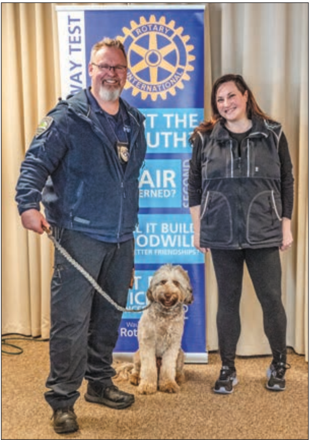
Barktastic Behavior met with Wautoma Rotary on Feb. 7.

Wautoma Rotary Club meets every Wednesday at Noon at Stahl Celebration Center in Wautoma. Guests are welcome. Have lunch, get to know Rotary Members, and enjoy great speakers sharing interesting information. Wautoma Rotary believes in Service above Self.