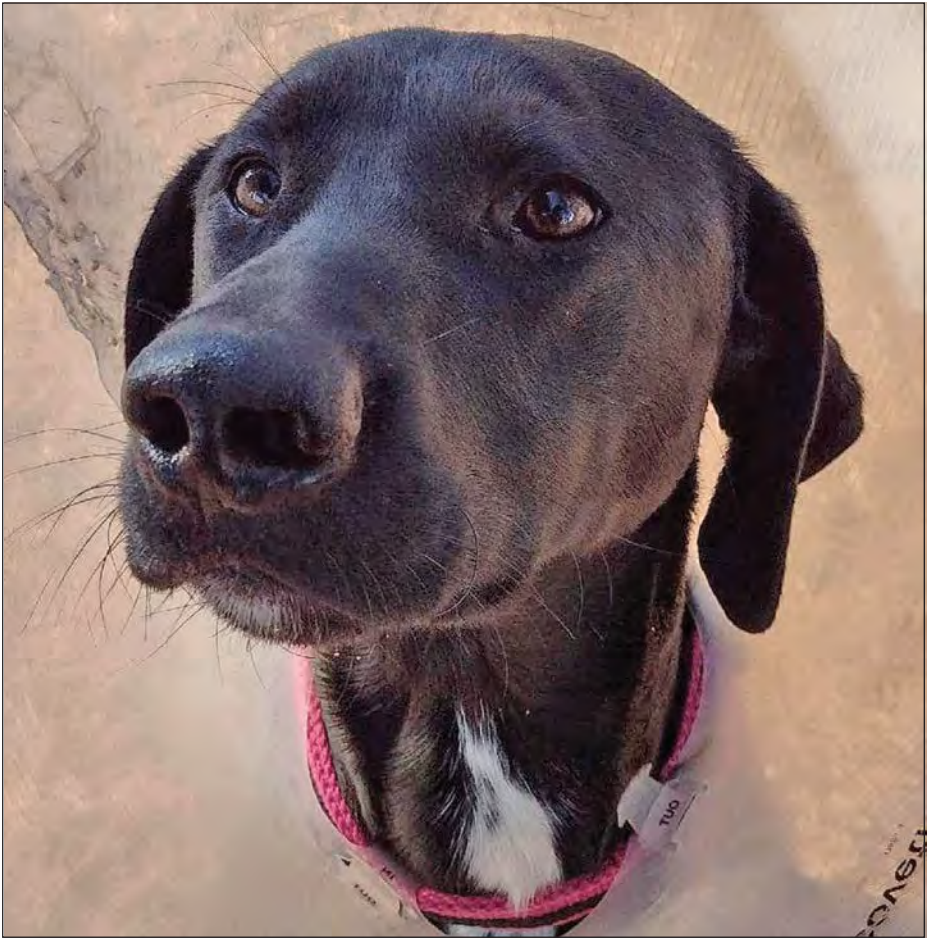
Cole is doing amazing in his foster home in Milwaukee, he's meeting dogs, kids, people and loving it! Cole is available for adoption, send in your application today as WCAS will be setting up meet and greets at the shelter after the holidays.

WCAS also wants to make sure the pet you are considering is the right fit for you. Adopters are welcome to fill out an application online. From there the shelter will schedule an meet and greet with the pet. If you have another pet, WCAS will also have them meet and greet with the animal you are considering apdopting to ensure they will get along. The shelter will also have potential adopters foster the pet they are interested in, with no commitment involved if it turns out to not be the right fit