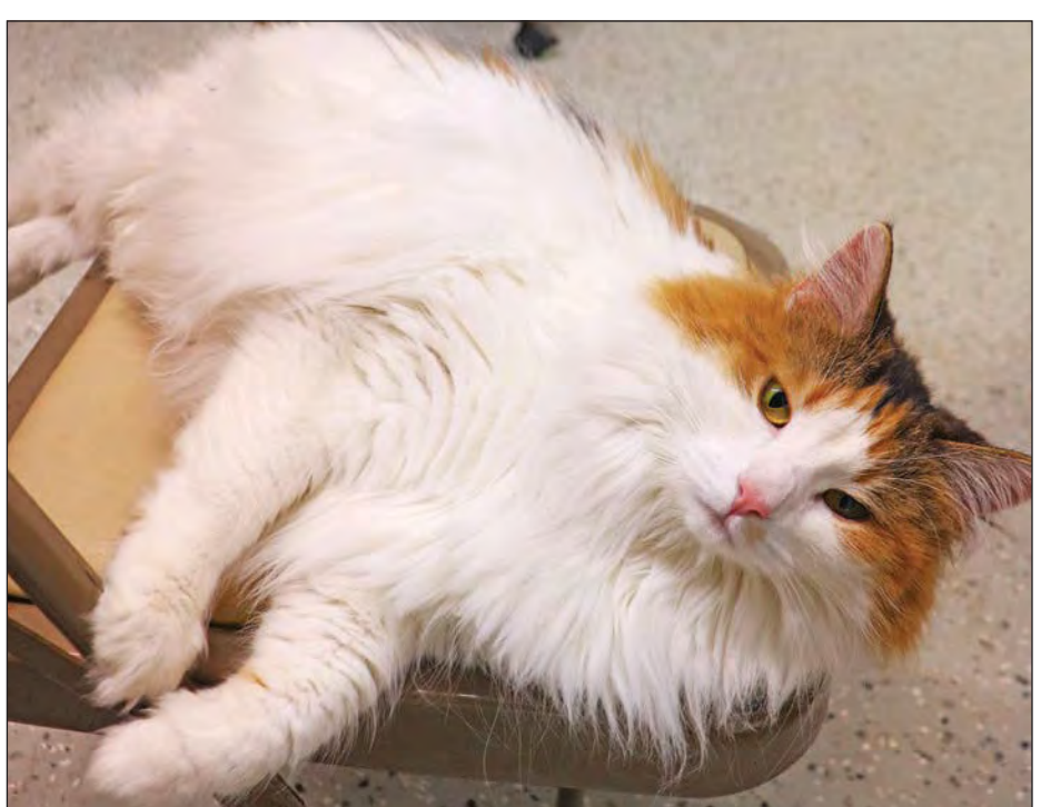
Sprecher is a five-year old laid back calico that would do best in a home as the only animal or with an older cat.

Learn more about the shelter by visiting their website, wausharacoanimalshelter. com, or visit their Facebook page. The shelter is located at N1748 St Rd 22, Wautoma. Waushara County Animal Shelter is an essential organization helping save animals in our area and across the state. They will continue to help find forever homes for our furry friends.